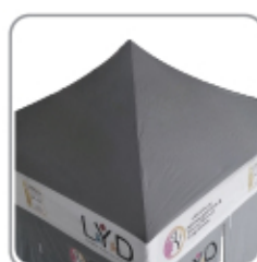
Exclusive seamless Rooftop and walls featuring no joins